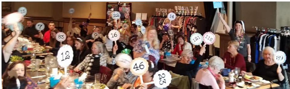
Attendees bidding to win the "Quarter Mania" Prizes.

Save the date for our annual meeting on June 13th, where we will honor our docents. Without them we would not be able to have so many community members and students enjoy the historic significance of our lovely house.