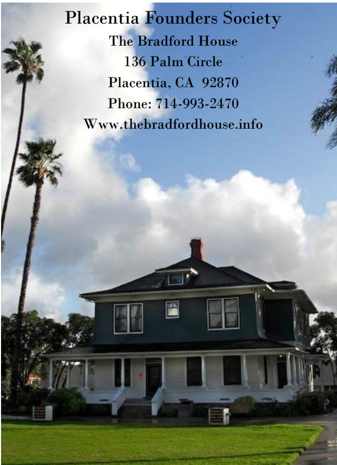
The Bradford House

The Placentia Founders Society was established in 1974 to preserve and maintain the Bradford House, which was built in 1902. Now it is a living museum, providing a glimpse into the lives of a pioneering family who made their fortune in the citrus industry. The House is open to the public for docent-led