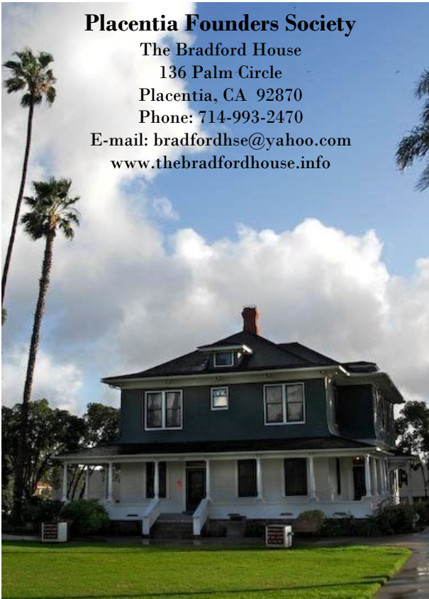
The Bradford House

E-mail: bradfordhse@yahoo.com www.thebradfordhouse.info