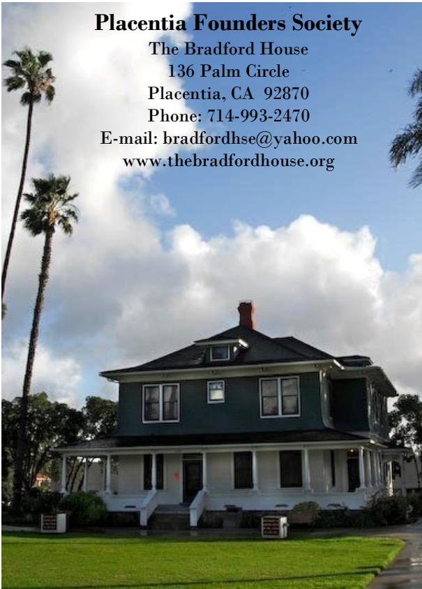
The Bradford House

The Bradford House 136 Palm Circle Placentia, CA 92870 Phone: 714-993-2470 E-mail: bradfordhse@yahoo.com www.thebradfordhouse.org