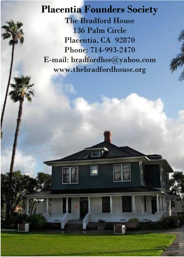
The Bradford House

The Bradford House 136 Palm Circle Placentia, CA 92870 Phone: 714-993-2470 E-mail: bradfordhse@yahoo.com www.thebradfordhouse.org