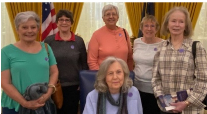
Girl Scout Troop 77 Reunion visit to the Bradford House