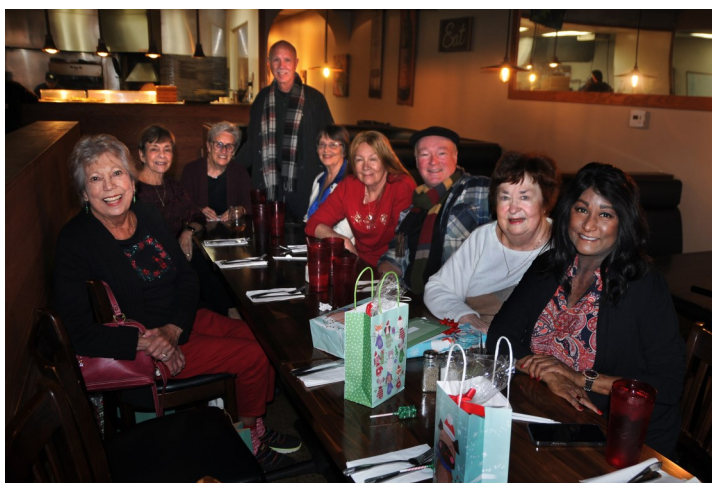
Placentia Founders Society enjoyed the season.