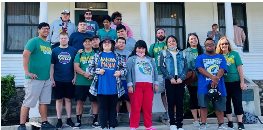
Brea-Olinda Adult Transition Program Tours the Bradford House