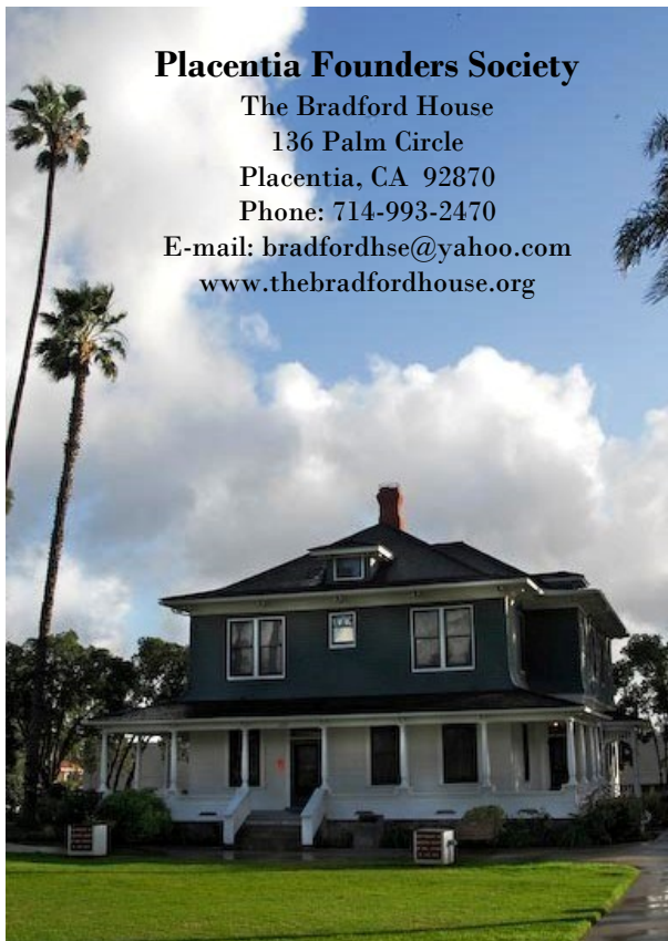
The Bradford House

The Bradford House 136 Palm Circle Placentia, CA 92870 Phone: 714-993-2470 E-mail: bradfordhse@yahoo.com www.thebradfordhouse.org