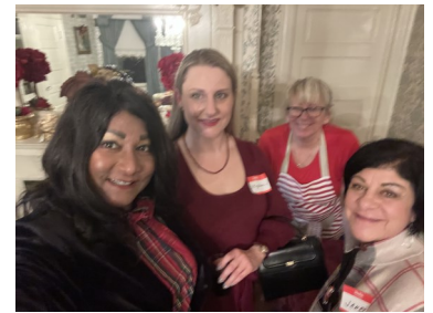
From setting up the decorations . . .