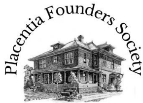
The Bradford House

136 Palm Circle Placentia, CA 92870 Phone: 714-993-2470 E-mail: bradfordhse@yahoo.com www.bradfordhouse.org