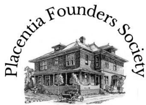
The Bradford House

136 Palm Circle Placentia, CA 92870 Phone: 714-993-2470 E-mail: bradfordhse@yahoo.com www.bradfordhouse.org