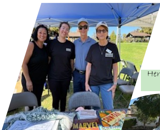
Heritage Days October