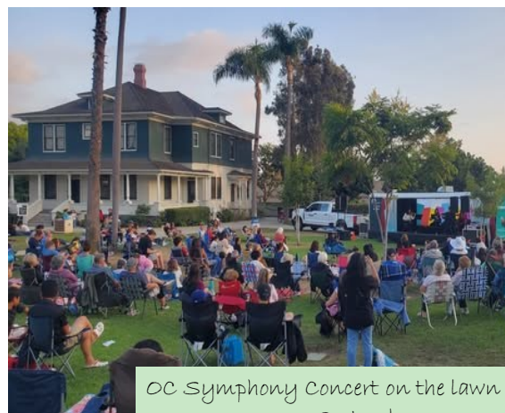
OC Symphony Concert on the lawn September