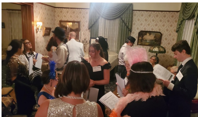
Mystery Night September