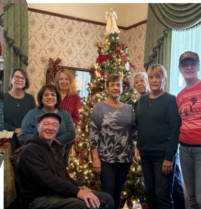
Christmas Party December